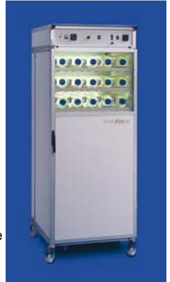
INCUDRIVE 90 CO 2 -incubator

The Bottle-Lifter (optional) allows for all 90 bottles to be loaded or removed simultaneously within seconds. The Lifter is mobile and sterilizable. It also serves to remove bottles from the incubator and to transport them to a separate room for harvesting, thereby minimizing the risk of crosscontamination.