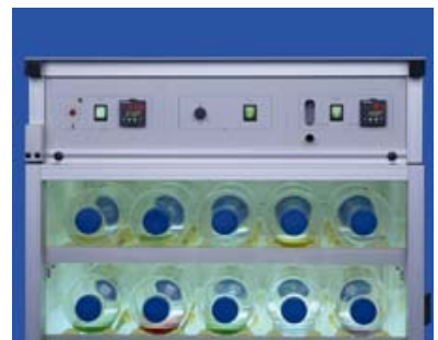
INCUDRIVE 90 CO 2 -incubator, frontpanel