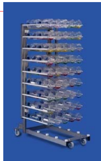
INCUDRIVE 90 Bottle-Lifter